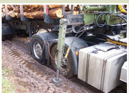
Timber haulage - Lower Tomvaich