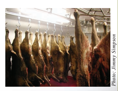
Carcasses hanging in the new deer larder.

The larder was commissioned on 1 October 2006.