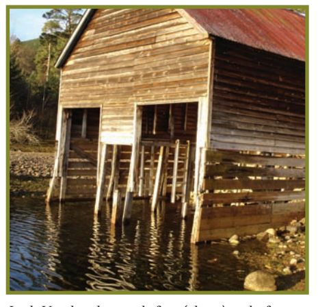
Loch Vaa boathouse- before (above) and after.

The first phase of work required a bund to be dug around the boathouse, with any water remaining in the bund being pumped back into the loch to allow new